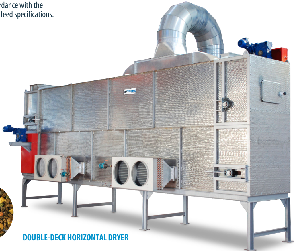
DOUBLE-DECK HORIZONTAL DRYER

600 Evler Mah. Balıkesir Asf. Sol Taraf No:96, 10201 Bandırma / Balıkesir